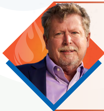
JIM WRIGHT Commissioner Railroad Commission of Texas